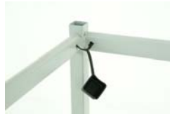
Corner Cap (Orange / Charcoal)